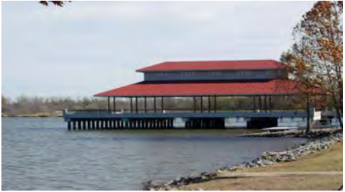
Lake Saracen - Pine Bluff, AR